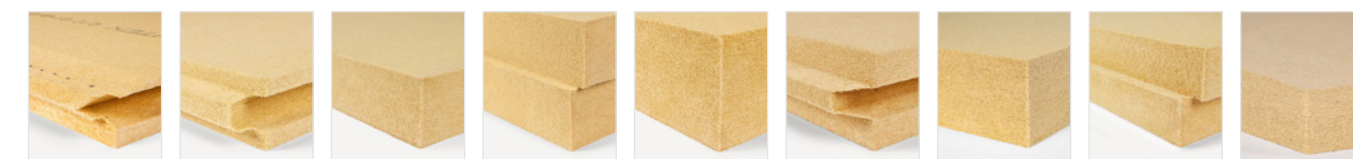
Ultratherm® Multitherm® Thermoroom® Thermosafe-homogen® Thermosafe-wd® Thermowall® Thermowall®-L Thermoflat® Pyroresist® wall