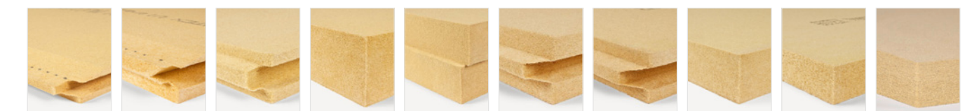
Multiplex-top® Ultratherm® Multitherm® Thermosafe-wd® Thermosafe-homogen® Thermowall® Thermowall®-gf Thermoroom® Thermostal® Pyroresist® wall

! For further information about model variants and what comes with products, visit www.festool.de